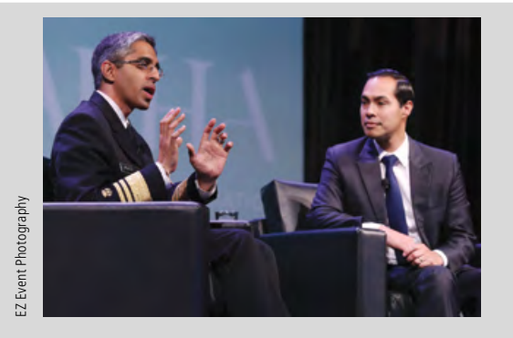
APHA Annual Meeting and Expo: The ultimate public health professional experience

Also, on the global stage, APHA worked with members of the World Federation of Public Health Associations to craft its first organizational policy on maternal mortality. The federation formally adopted the policy in May 2016, and public health associations worldwide are expected to use the policy to advance maternal and child health in their own countries.