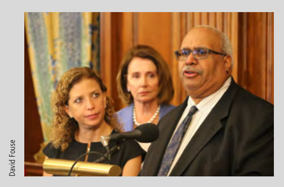
Zika virus: Speaking out for public health funding

The Association is proactive in supporting public health internationally as well. In the last year, APHA met with leaders of other public health associations to help strengthen the Alliance of Public Health Associations of the Americas.