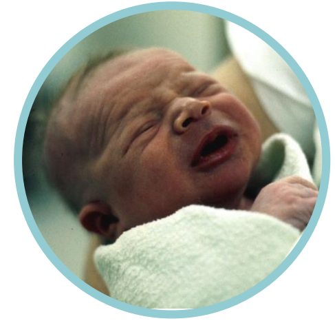
Adverse birth outcomes