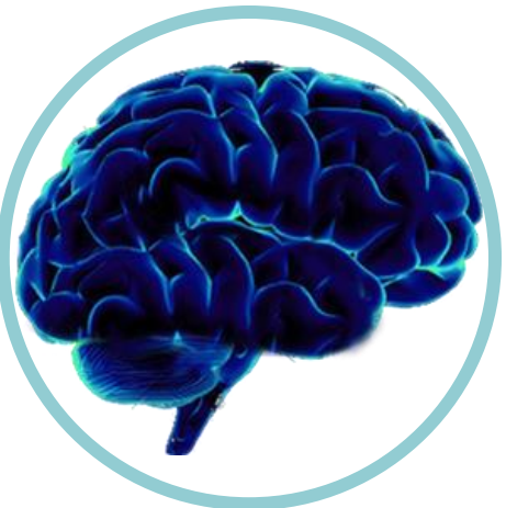
Growing evidence for impact on brain development and cognitive function