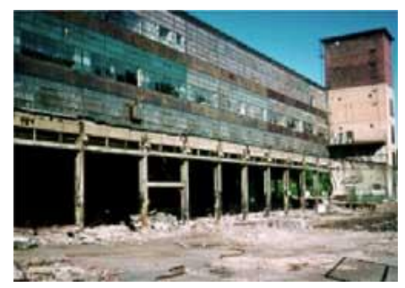
The Abandoned Lectromelt Electroplating Plant