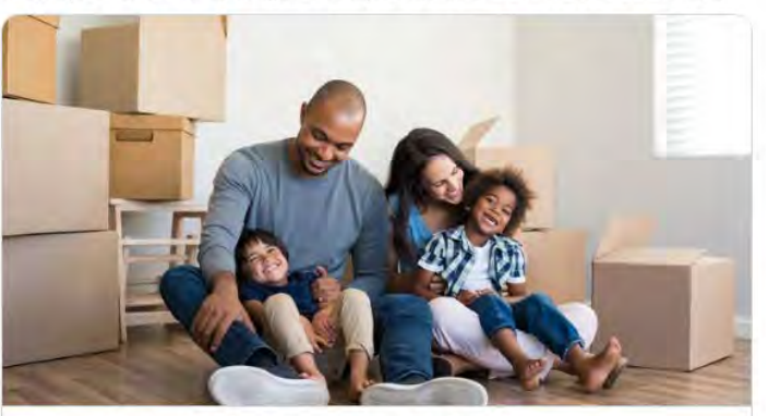
The State of Latino Housing, Transportation, and Green Space Latino communities experience lower-quality housing that is further away from public transportation with less green space, but key solutions are emerging. & salud-america.org

BREAKING: See the alarming state of #Latino housing, transportation, and green space, via our new research: