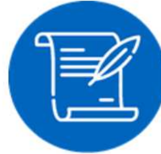
Will or Trust