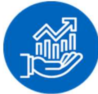
Stock and Investment Accounts