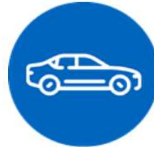
Donate a Vehicle