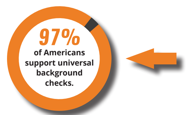
Source: Quinnipiac University National Poll. (May 22, 2019). Retrieved from https://poll.qu.edu/national/release-detail?ReleaseID=2623

From there, Gov. Malloy and his administration published a document outlining the changes in their community that needed to take place, then shared it at town hall meetings and other local events. Less than six months after the shooting, the state passed a comprehensive bill on gun control and school safety.