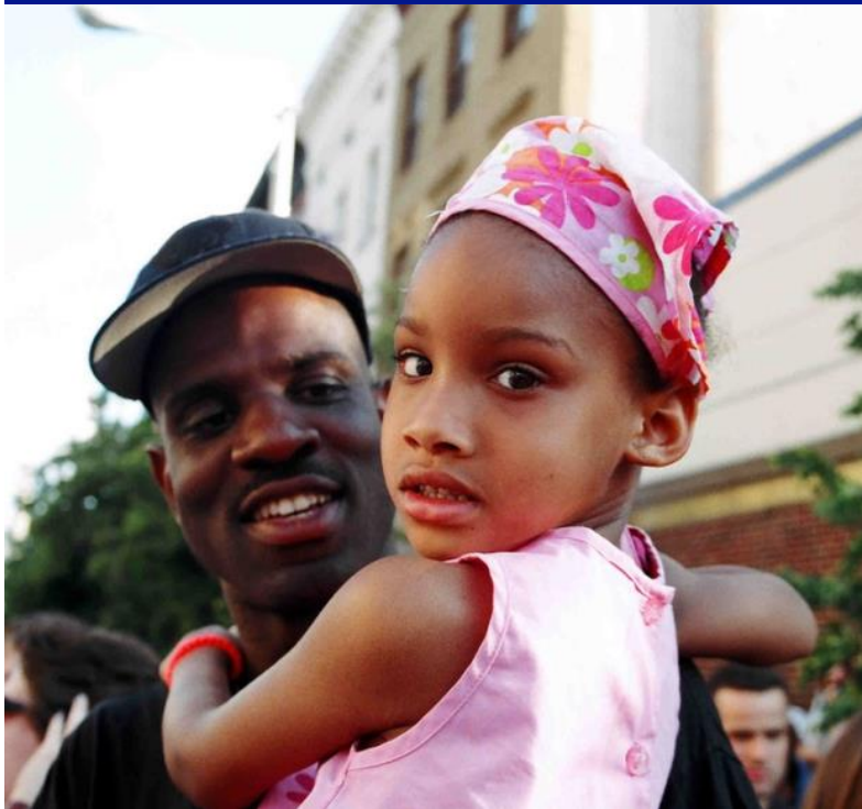
cc Elvert Barnes