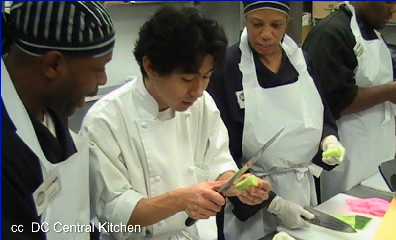
cc DC Central Kitchen