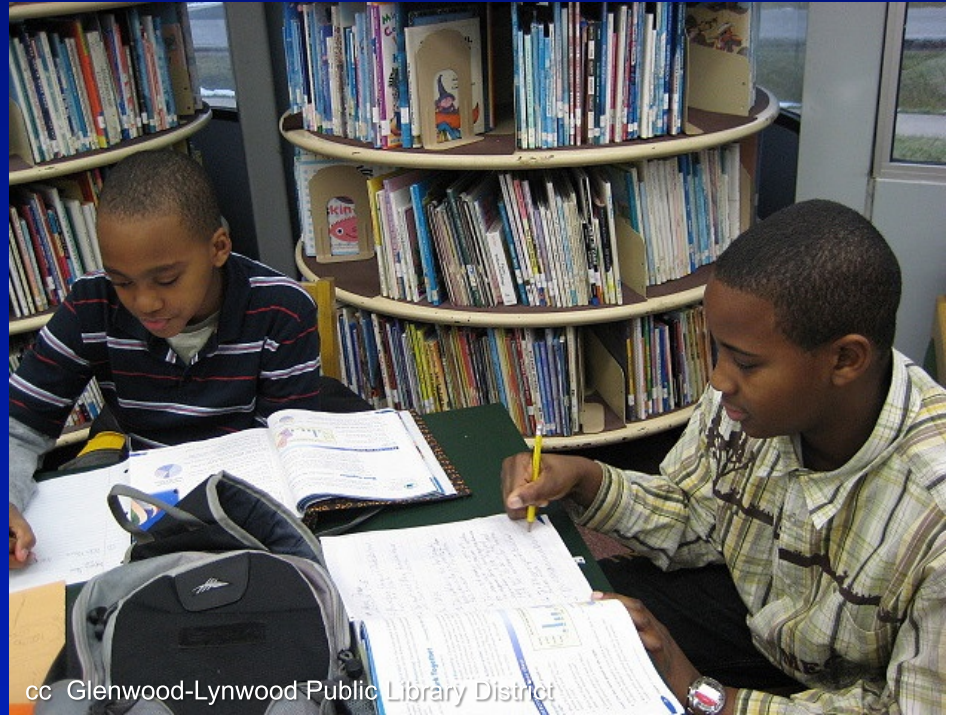
cc Glenwood-Lynwood Public Library District