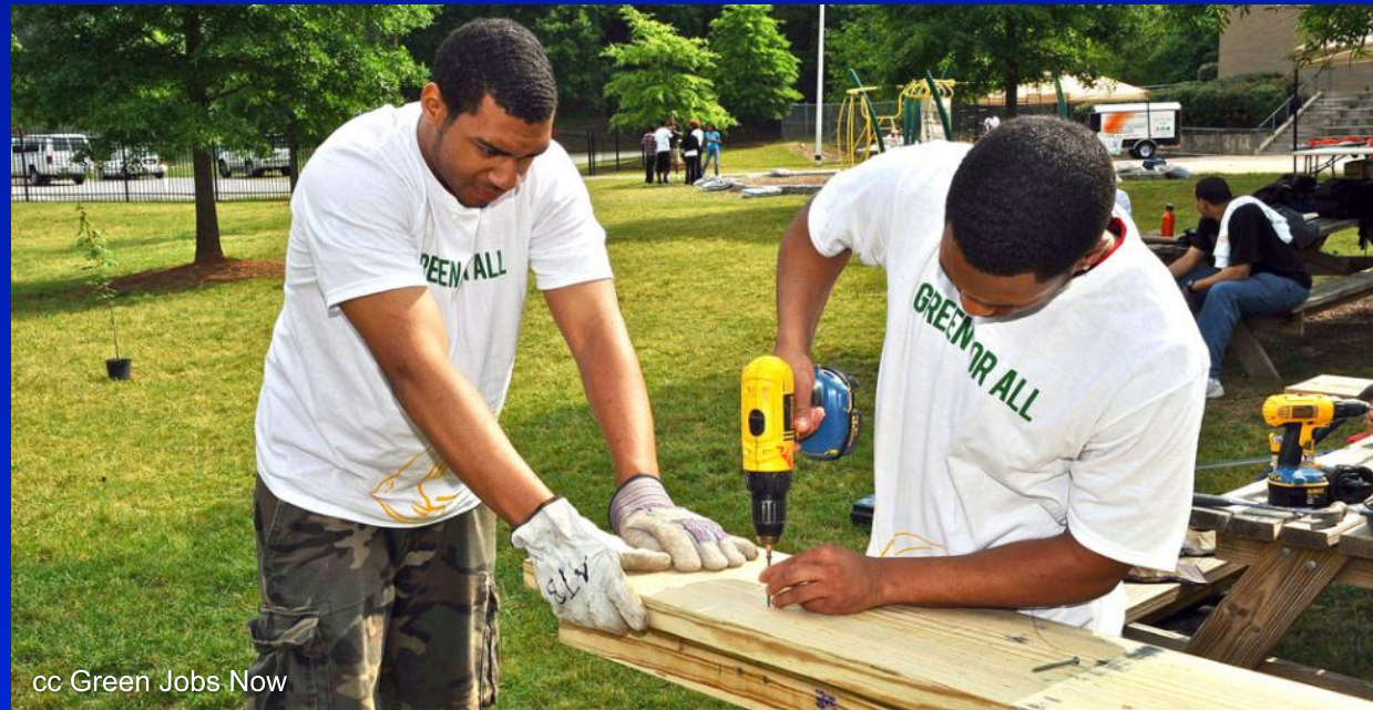
cc Green Jobs Now