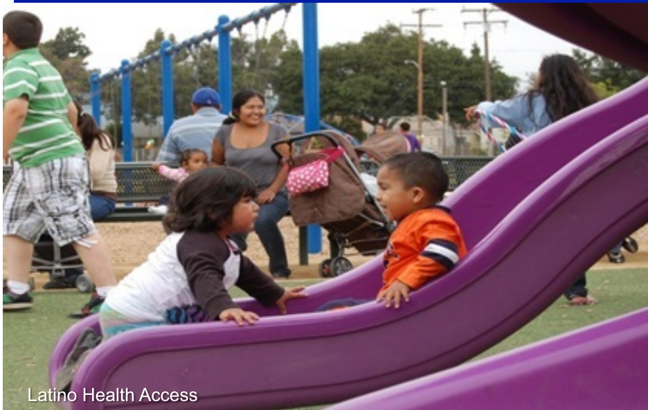
Latino Health Access