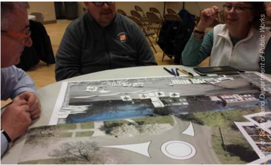
Gathering neighborhood input

Here are the questions they asked in South Bend →