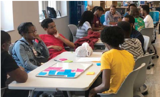
Students, teachers and stakeholders engage in the design process for Banneker High School

Here are the questions they asked in Washington, DC →