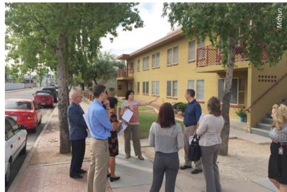
Edison Eastlake neighborhood tour with project partners.

"Between 50 to 80 percent of a person's health outcomes are determined by the built and/or socio-economic environment," Ishizaki says, "We can have the greatest impact by being intentional with design that is responsive to specific needs — and listening to those needs from the very beginning."