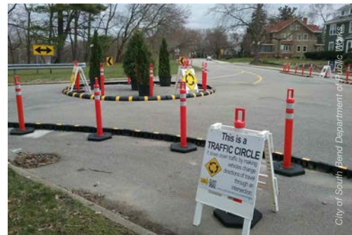
Temporary traffic circle installation, prior to painting