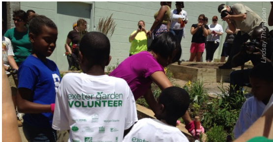
Then-mayor Stephanie Rawlings-Blake works with neighborhood volunteers to plant the first seedlings during Historic Jonestown neighborhood's Exeter Gardens Community Day

Here are the questions they asked in Baltimore →