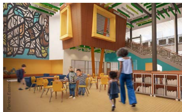
Rendering of West Elementary School learning commons

DCPS is also exploring net-zero-energy buildings, indoor environmental quality measures, material health, rooftop school gardens, outdoor classrooms and bike trails, and activating hallways with elements such as floor balance beams and active collaboration spaces. These conversations are creating novel ideas and solutions for important resources: our community members and leaders of tomorrow.