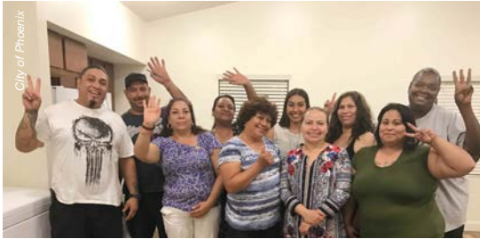
Resident Leadership class.

Here are the questions they asked in Phoenix →